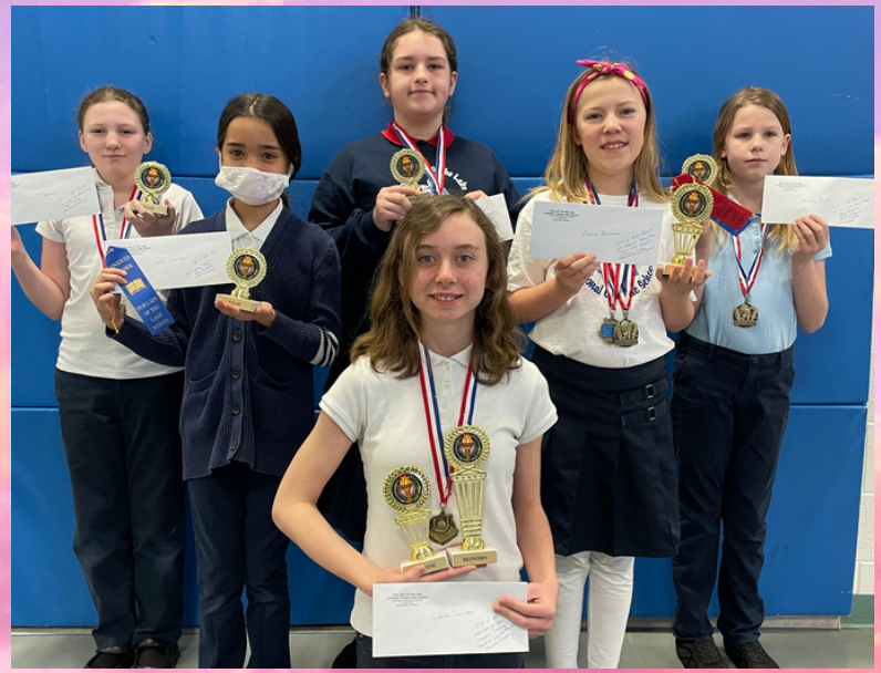
Pictured to the left are "Super" and "Advanced" readers earning between 50-99 AR points. Pictured to the right are students that have earned between 100-413 AR points and it's only March. Congratulations to all and we thank everyone for promoting March Reading Month!