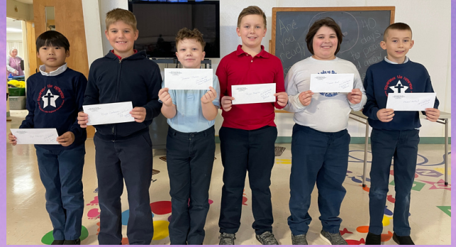
Pictured left are students that have earned at least 10 AR points. Pictured right are students that are "Independent Readers" earning 25 or more AR points.