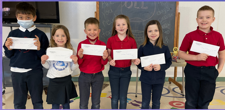
Pictured to the Left are K-1st graders who have earned 0.5-2.0 AR points! Pictured to the right are students that have earned at least 5 AR points.