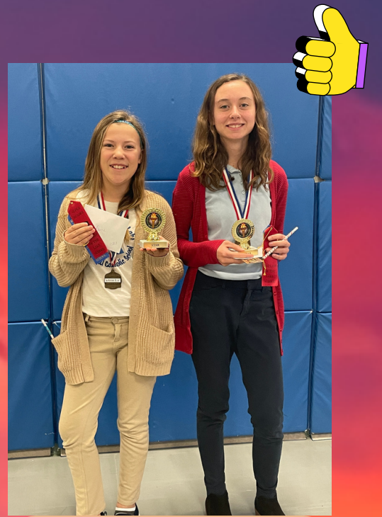
Fantastic 4 Readers 150-200 AR points