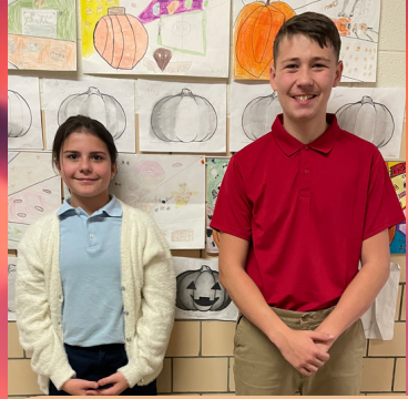
Independent Readers 25-49 AR points (Absent - Trace Paiva)