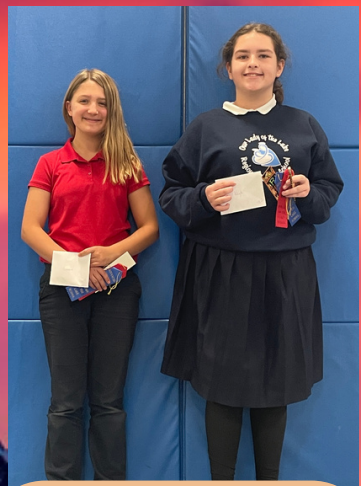
Advanced Readers 75-99 AR points