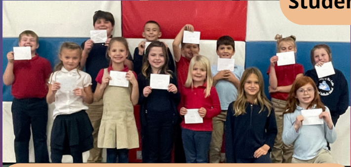
Students who have 5-9.9 AR pts