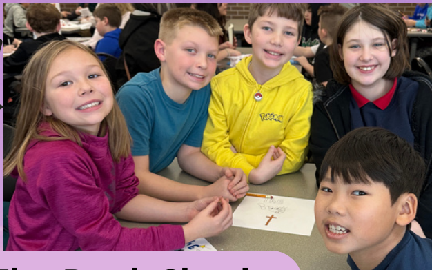
The Book Sharks