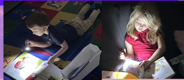
Link to Service Hour Needs